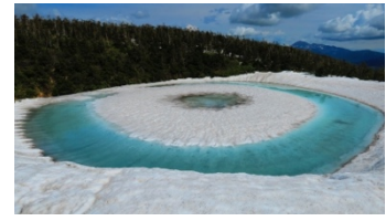
Hachimantai Dragon Eye